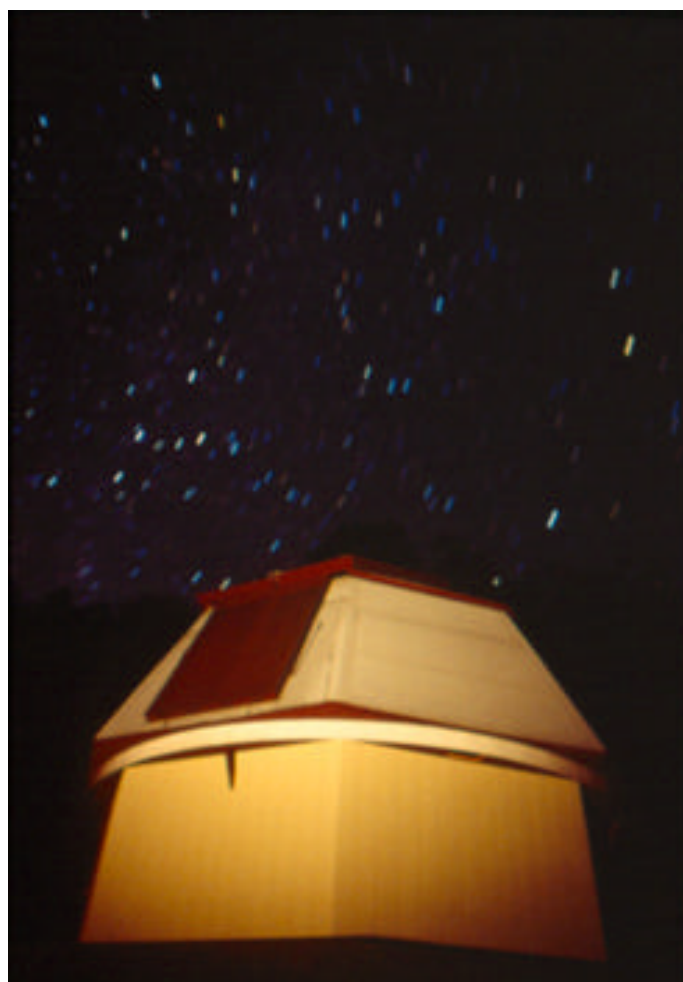
Below: Cassiopeia by Carl Milazzo