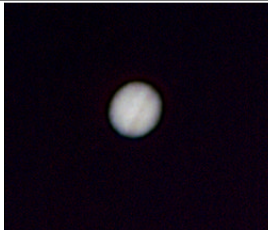
Above: Jupiter by Jamie Seibert 1/250 shot through a 150mm Mak-Cass with 2x teleconverter