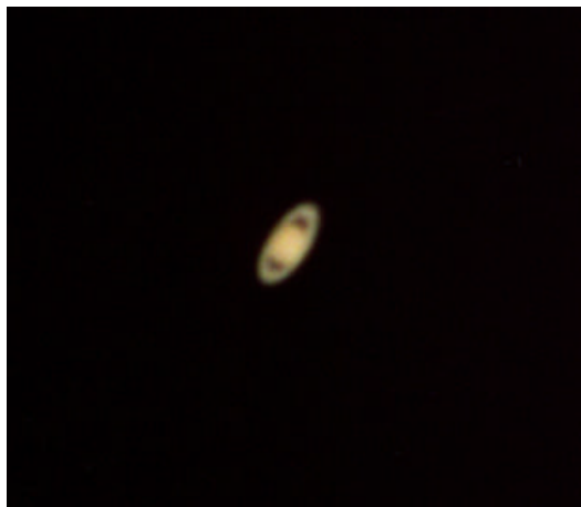
Below: Saturn by Jamie Seibert 1/60 shot through a 150mm Mak-Cass with 2x teleconverter.